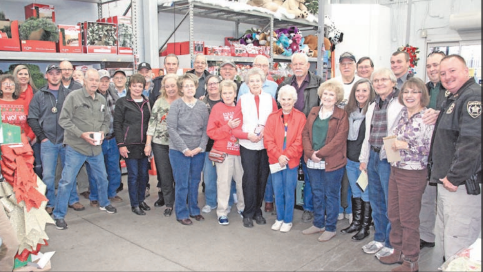
The Blairsville Cruisers and other volunteers on Tuesday, Dec. 12, just before the kids arrived to begin the Shop with a Cruiser Christmas experience.